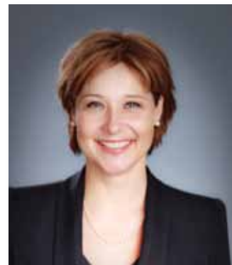
Christy Clark Premier

A handwritten signature in black ink that reads 'Christy Clark'.